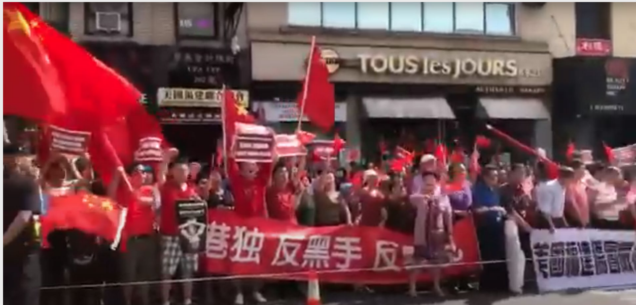
Figure 4: Pro-CCP counter protests in San Francisco taken from video submission to ACHK.

After posting and promoting the events between August 13-16, organizers noticed an increase in pro-CCP social media activity in all major cities that targeted the event and community groups. Pro-CCP forces were intimidating, rebuking and harassing Hong Kong pro-democracy protesters. They coordinated highly organized counter protests within days of event announcements. These coordinated efforts includes the creation of multiple WeChat groups (in many of the cities), with corresponding pages on tencent and other sites signalling to bring down the "港獨" (Hong Kong pro-independence activists, which is propaganda and misinformation). The movement called for the Hong Kong Government to answer to the protests' five demands, which does not include the narratives that the pro-CCP forces are conveying, with attempts to mischaracterize the movement. 8