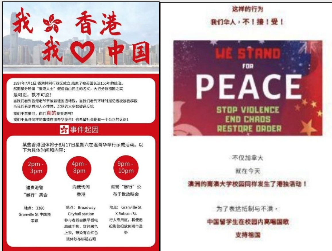
Figure 2: Pro-CCP counter protest information on sites that were being circulated on WeChat.

Organic and spontaneous resistance to the planned pro-Hong Kong events was expected. Peaceful counter-protests are naturally permissible given existing free expression guaranteed in Canada and elsewhere. However, pro-Hong Kong organizers expressed concerns about a more concerted and organized counter-movement. Organizers began to see evidence of a coordinated effort to disrupt and/or prevent pro-Hong Kong events. These efforts bear the hallmarks of official, state-condoned Chinese disinformation and intimidation campaigns.