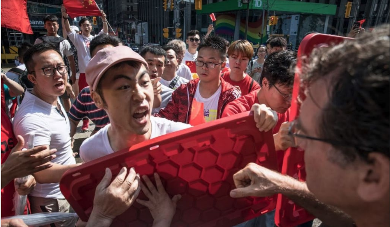
Figure 6: Pro-CCP counter protesters in Toronto inciting violence.

At almost every counter protest, several individuals in the crowd were holding DSLRs and cell phone cameras to take videos and headshots of pro-democracy protesters. This is similar to surveillance tactics employed by CCP agents who try to capture images to later identify using facial recognition processes. 10 In some cases, headshots and candid photos of organizers were posted online and several individuals were doxxed after the incidents.