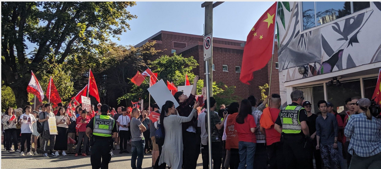
Figure 1: August 18, 2019 Pro-CCP crowd surrounded a church - a prayer meeting for Hong Kong.

The first set of international “Global Solidarity with Hong Kong” events 3 4 were scheduled to coincide on the weekend of August 16 to 19, 2019 during Stand with Hong Kong’s “Power to the People Rally” 5 . 30 cities around the globe organized rallies and demonstrations during that weekend. Organizing these solidarity events during this time period was done via social media in a loosely coordinated effort by the disparate pro-Hong Kong democracy groups across the world in order to amplify their message and garner increased media attention 6 . Prior to the aforementioned weekend in August, when marketing of the events happened, concerns began to rapidly emerge among the pro-Hong Kong movement, in Canada and abroad, about an increase in harassment from pro-CCP organizations and individuals.