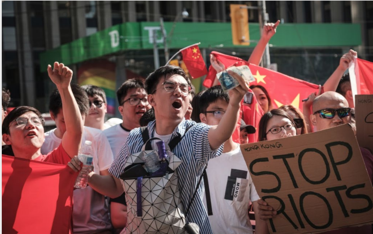
Figure 5: Pro-CCP counter protesters in Toronto hurling insults, photo credit: Joshua Best (IG: @joshuabest).

Though separated by cities and claiming to have sprung up organically, chants, slogans, signs and tactics of the pro-Beijing supporters are too similar to be coincidental. Large, crisp, new Chinese flags were seen at almost every rally and the Chinese anthem was loudly chanted and sung to silence Hong Kong pro-democracy protesters. Senior members of several Chinese pro-Beijing community organizations were also identified among the pro-CCP crowd in a few cities. 9 Threats and insults were hurled, shouting matches occurred and it was an entirely bizarre experience for the Hong Kong pro-democracy supporters as it was a blatant attempt to suppress their freedoms of expression.